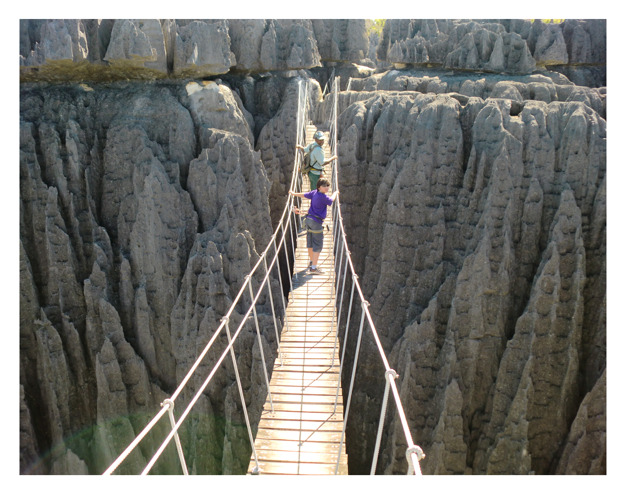
Volunteers Handbook 2022